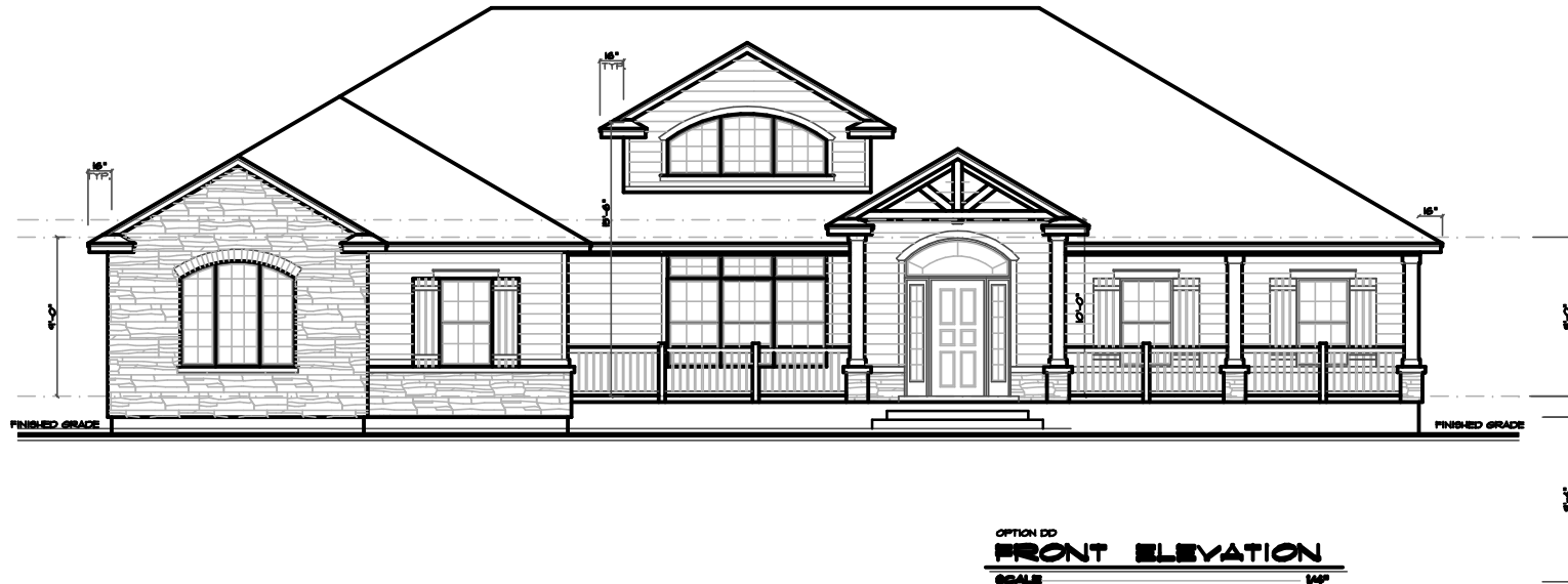
OPTION DD FRONT ELEVATION SCALE 1/8"