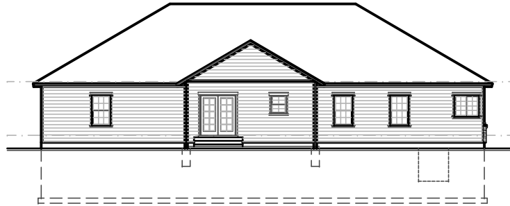
REAR ELEVATION SCALE 1/8"