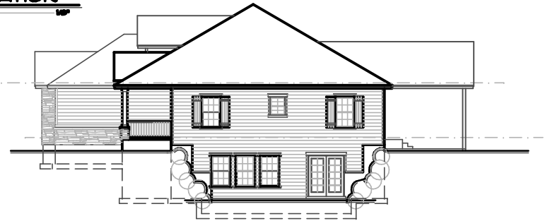
RIGHT ELEVATION SCALE 1/8"