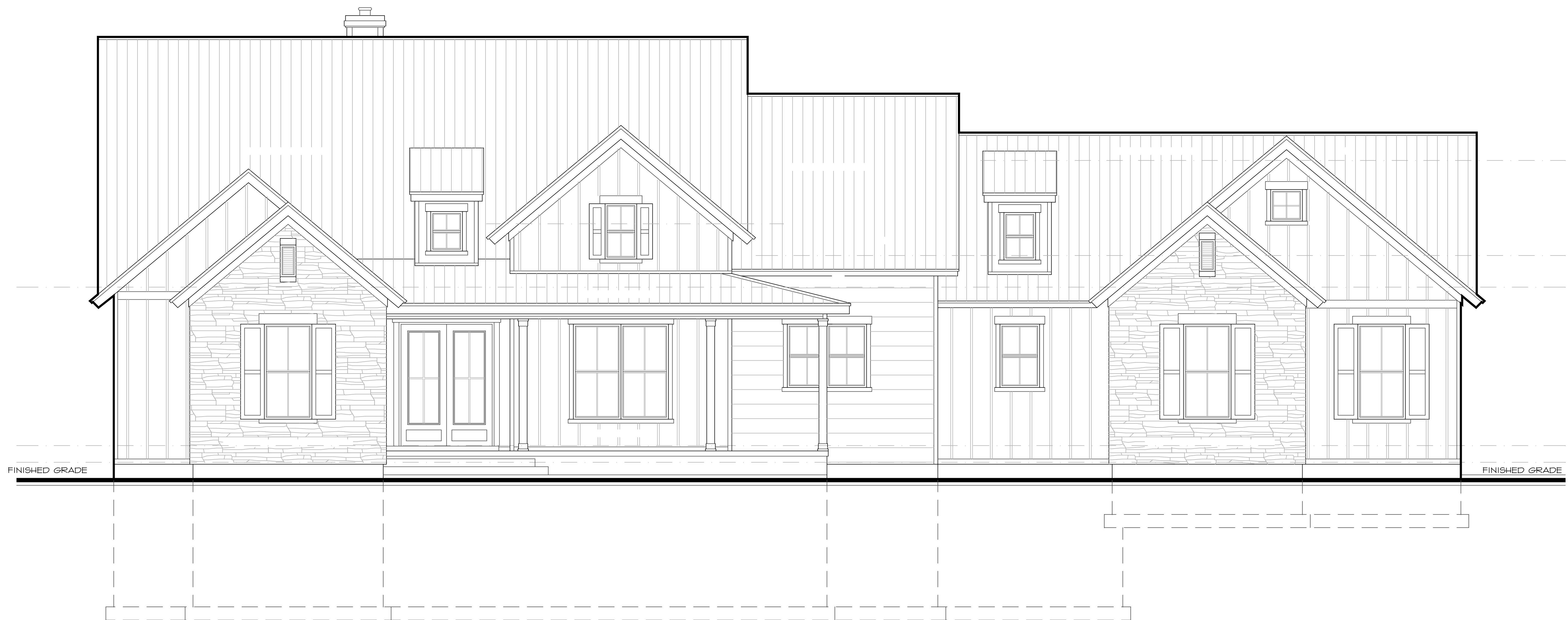
FRONT ELEVATION SCALE _____ NTS