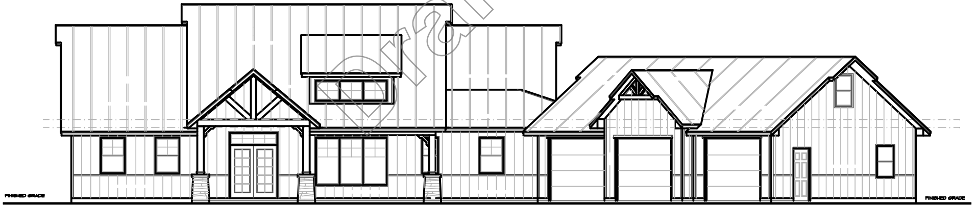
FRONT ELEVATION SCALE NTS