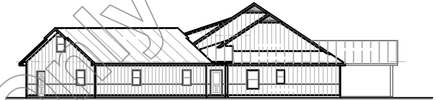
RIGHT ELEVATION SCALE NTS