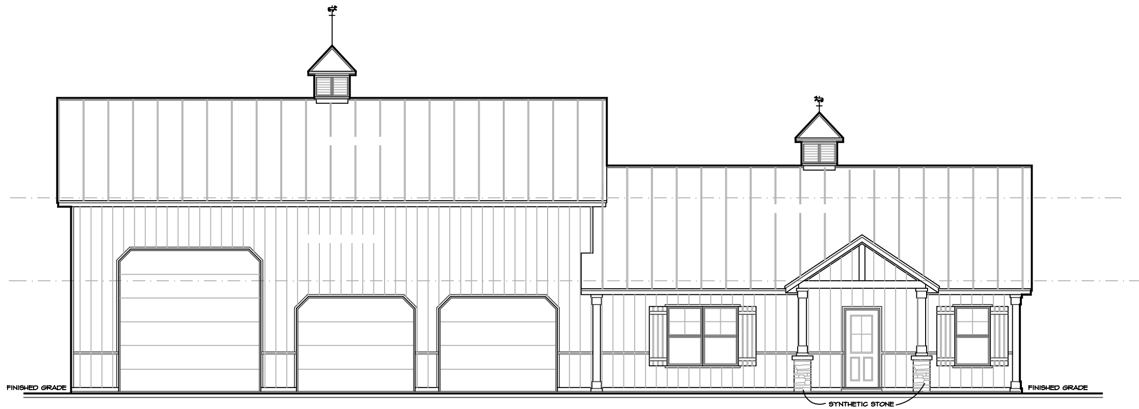
FRONT ELEVATION SCALE _____ NTS

Grand River Design HOME DESIGN SERVICE Gallatin Missouri 64640 (660) 605-3190