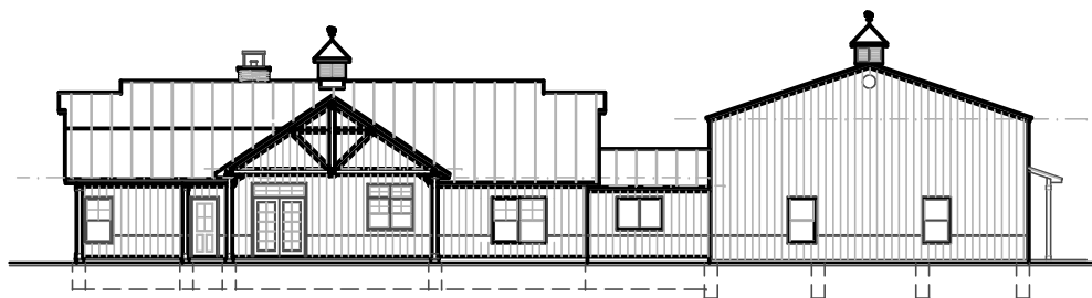
REAR ELEVATION SCALE 1/8" = 1'-0"