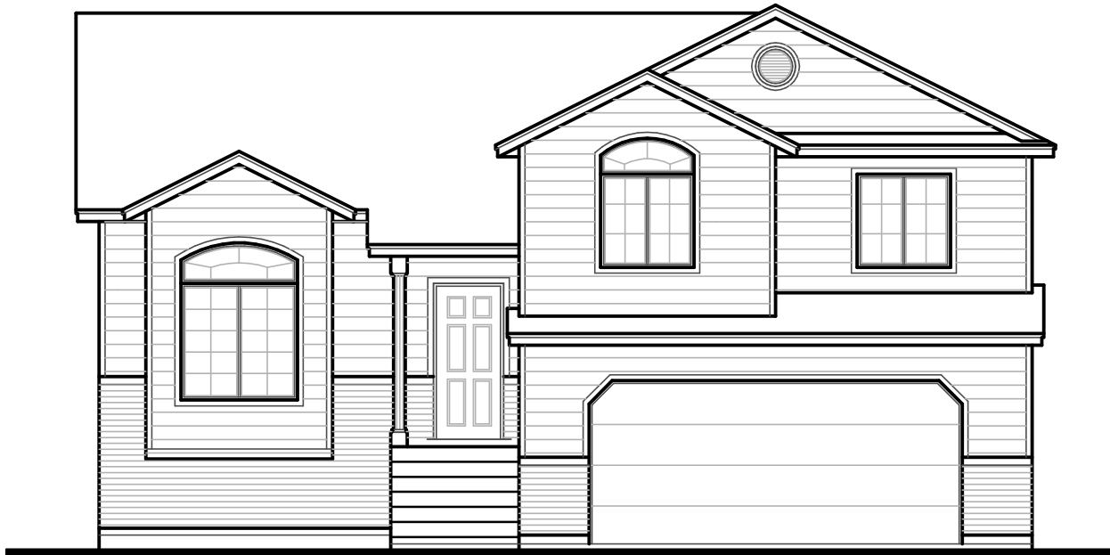
HAMPTON "A" S-1210-02CE