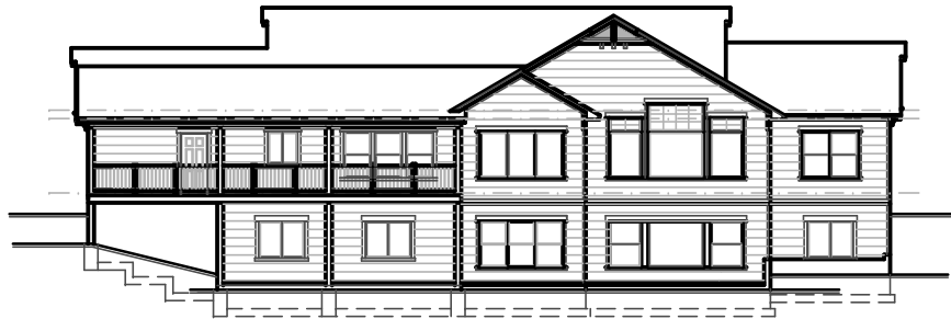
REAR ELEVATION SCALE 1/4"