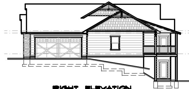
RIGHT ELEVATION SCALE 1/4"